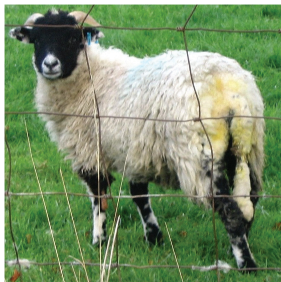
Fig 5: This Swaledale lamb has been 'dagged' around the breech and had fly repellent applied

Blowfly strike is currently controlled primarily through the prophylactic and therapeutic use of neurotoxic insecticides [Bates 2004, Bisdorf and Wall 2008].