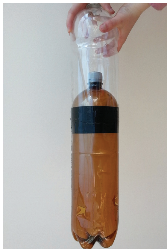
Fig 6: A home-made trap for blowflies is easy to make, using two 2-litre plastic drinks bottles, one clear and one brown. Offal is placed in the bottom of the brown bottle and cross cuts are made to allow the flies in. The flies will be trapped in the top clear bottle, from which they can be easily disposed of

in the clear bottle. Trapped flies can be emptied through the lid of the clear bottle. Due to the later emergence of L. sericata compared to L. caesar and the similar appearance