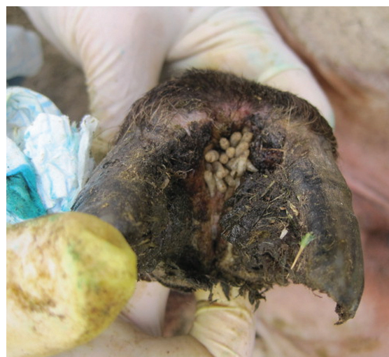
Fig 3: Lucilia maggots in the interdigital space of a foot with foot rot