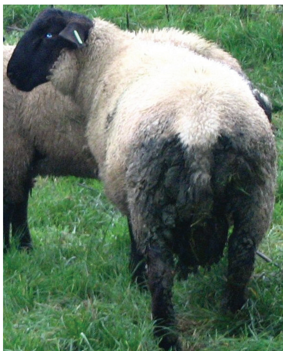
Fig 4: This Suffolk ram lamb has extensive faecal soiling and so is at increased risk of breech strike at a risk time of year

strike incidence [Smith and Wall 1998] and oviposition will occur only on the most highly susceptible animals, which are those that are most heavily faecally soiled. During the summer, as fly abundance increases, ewes are sheared which reduces their susceptibility. However, for lambs, their wool grows, increasing susceptibility, and they begin to scour as they ingest increasingly large nematode burdens. Hence, the high fly challenge is focused increasingly on lambs and the incidence of both breech and body strikes increases.