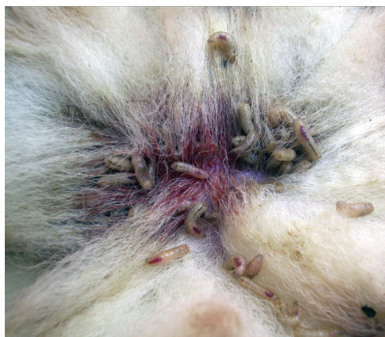
Fig 2: Blowfly strike can be hard to detect; however, larvae may be seen, as in this case of fly strike showing fully fed third stage larvae