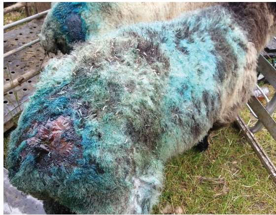
Fig 7: Two lambs treated for breech strike by the usual method of clipping away wool around the struck area and the direct application of a synthetic pyrethroid. It is not hard to see how strike causes a considerable growth check in growing lambs